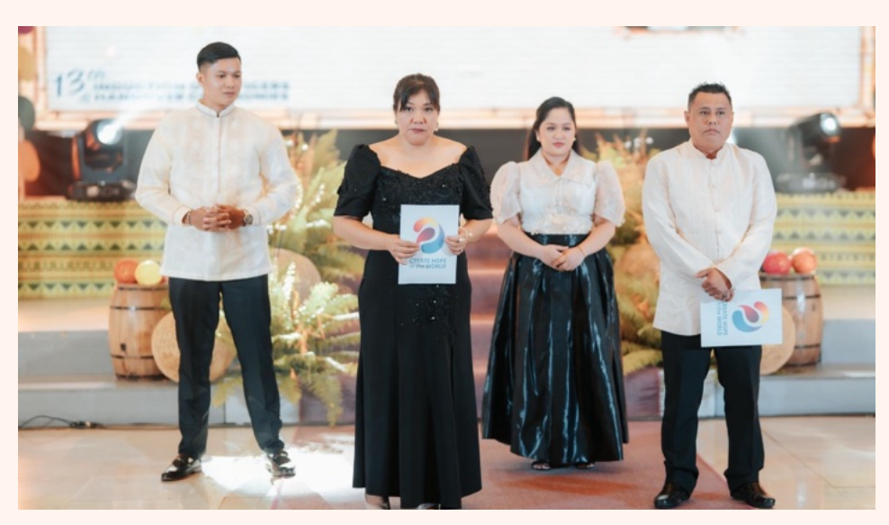
The new members of the Rotary Club of Central Butuan